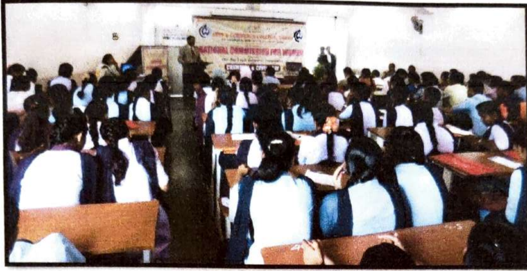
Students participating in Legal Awareness Programme.