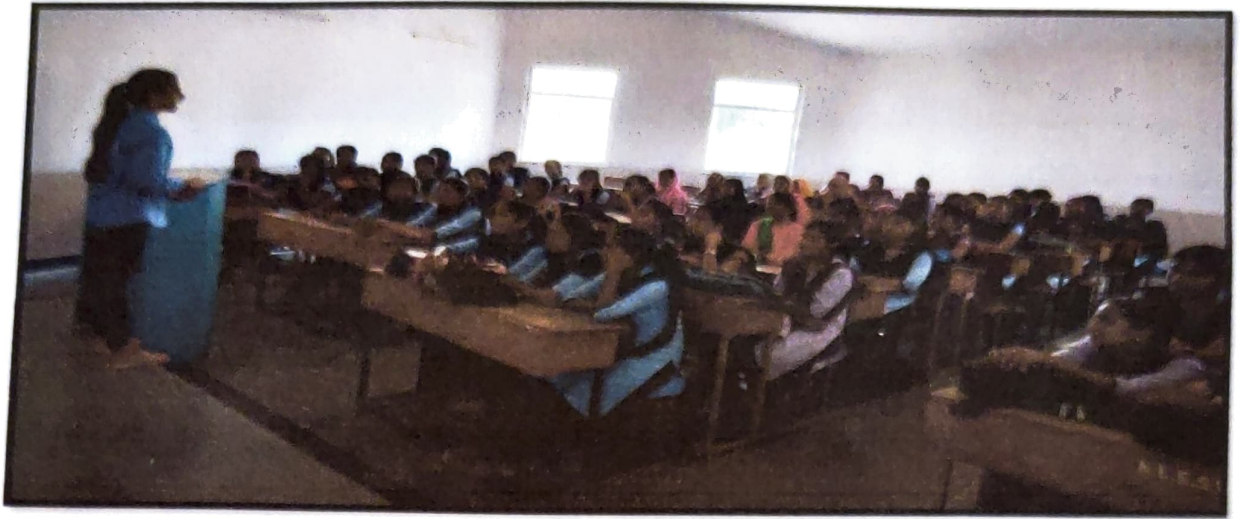
Theoretical as well as practical sessions by the Master Trainer- DARE