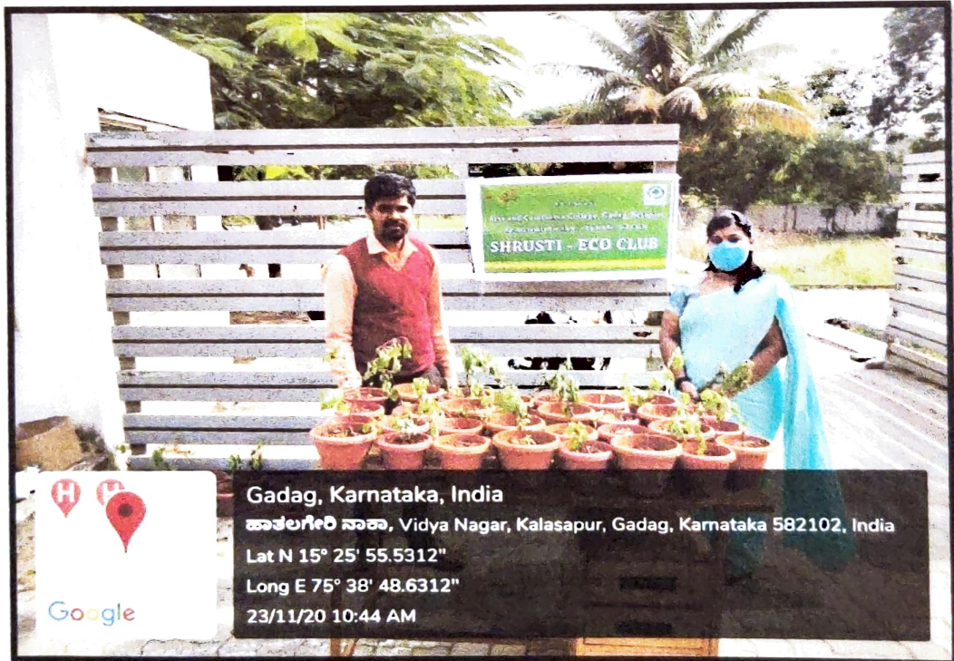
Tulsi Plants ready to Donate

ARQ th CO-ORDINATOR IQAC K.L.E.S' Arts & Commerce College GADAG