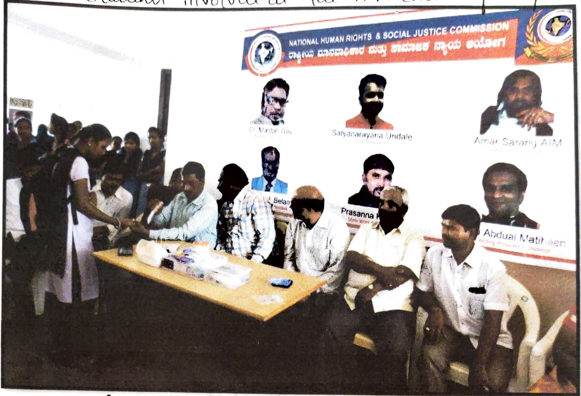
Girls Students attend the camp