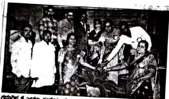
ಗದಗಿನ ಕೆ.ಎಲ್.ಇ. ಸಂಸ್ಥೆಯ ಕಲಾ ಹಾಗೂ ವಾಣಿಜ್ಯ ಮಹಾವಿದ್ಯಾಲಯದಲ್ಲಿ ಮಾನವ ಹಕ್ಕುಗಳ ತರಬೇತಿ ಕಾರ್ಯಕ್ರಮ ಗಣ್ಯರು ಉದ್ಘಾಟಿಸಿದರು

CO-ORDINATOR IQAC K.L.E.S' Arts & Commerce College GADAG