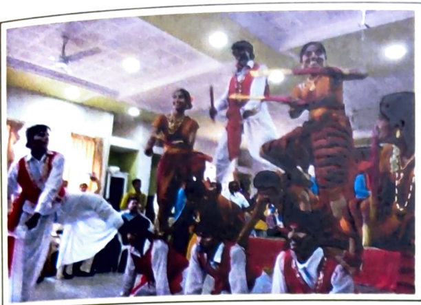
Folk Tribal Dance by our students at University Youth Festival.