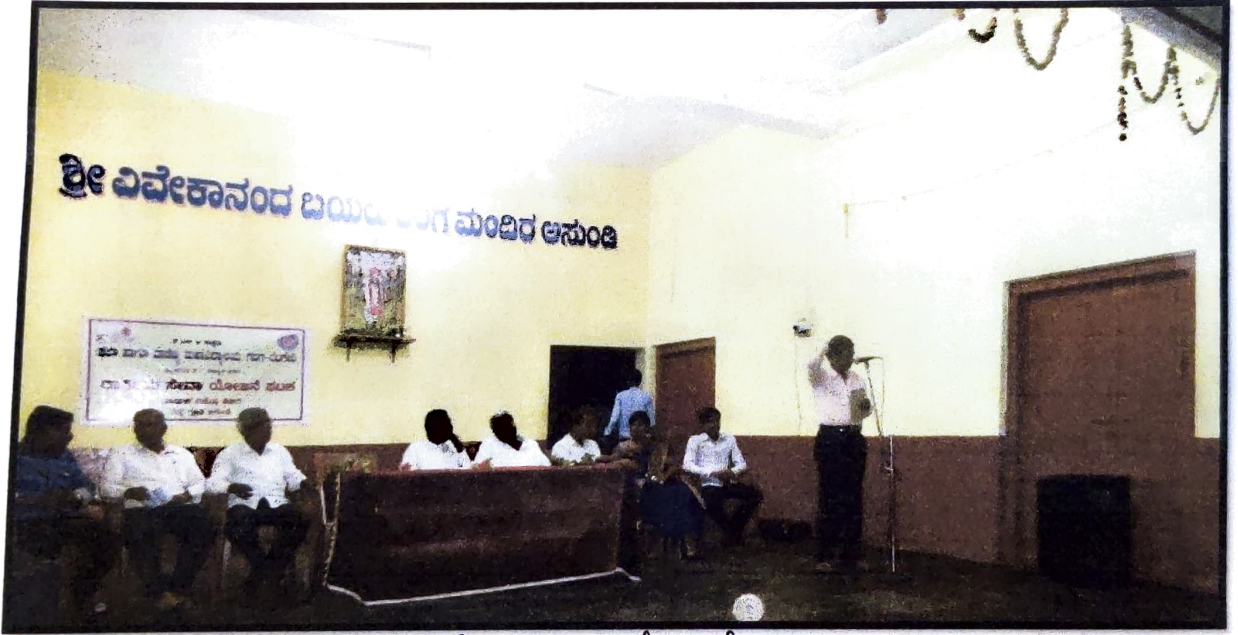
Special Lecture organized at NSS Camp.