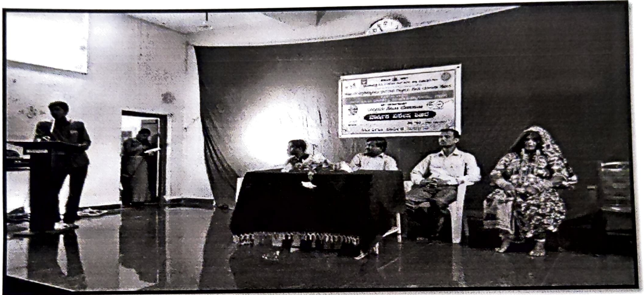
NSS Volunteers and Community people at A Special Lecture on Role of Youth in the Cleaning of Villages