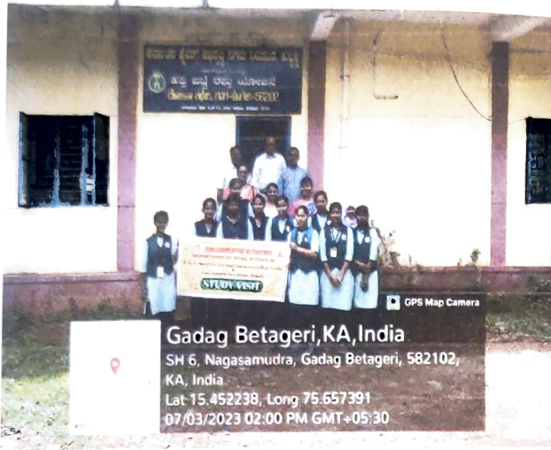
Gadag Betageri, KA, India SH 6, Nagasamudra, Gadag Betageri, 582102, KA, India Lat: 15.452238, Long 75.657391 07/03/2023 02:00 PM GMT+05:30