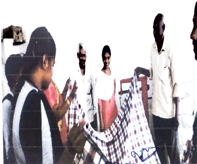
CO-ORDINATOR IQAC K.L.E.S' Arts & Commerce College GADAG