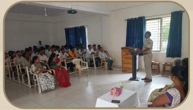
Cyber Crime Awareness Programme