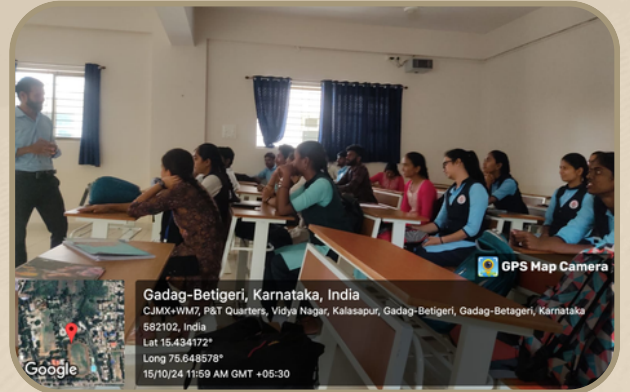
One Day Workshop on “Career Guidance for BA and B Com Students on 15-10-2024