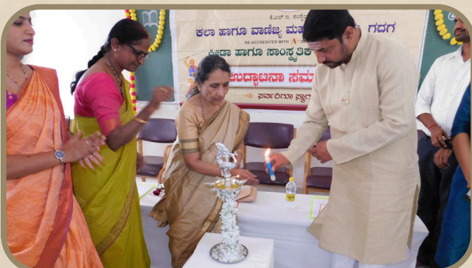
Inauguration Ceremony of College Union and Gymkhana Activities