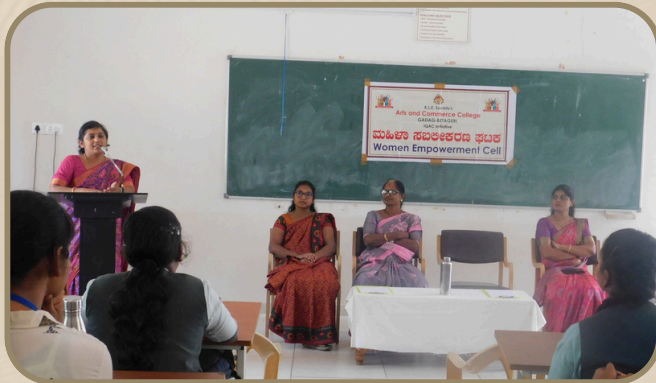
One Day Workshop on “Women’s Right” under Women Empowerment Cell on 14-03-2025