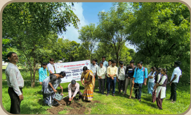
Plantation Programme organized by NSS