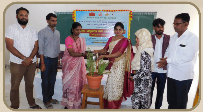
Workshop on "Ranga Tarabeti" held on 22-11-2024