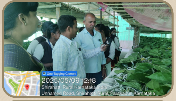
Study Visit to Seri Culture Farm, Shirahatti by Home Science and Economics Department on 09-05-2025