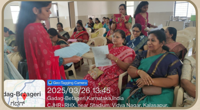
ISR activity on “Cervical Cancer Awareness” by Home Science Department on 26-03-2025