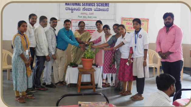
Blood Donation Camp held on 02-10-2024 under NSS, YRC and RRC