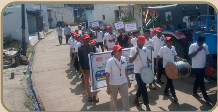
NSS Special Camp held at Adopted Village Nagavi, Awareness Rally