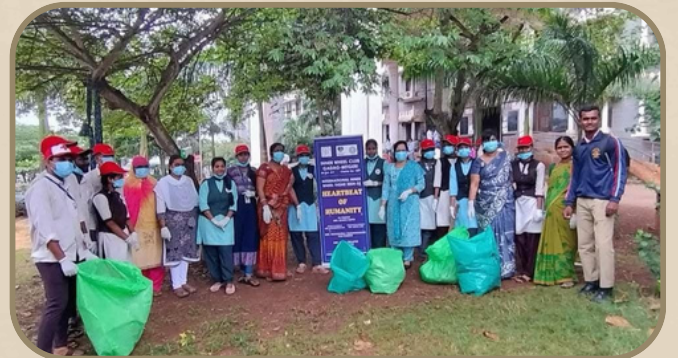
Cleaning Programme at GIMS Hospital by NSS Volunteers in association with IWC