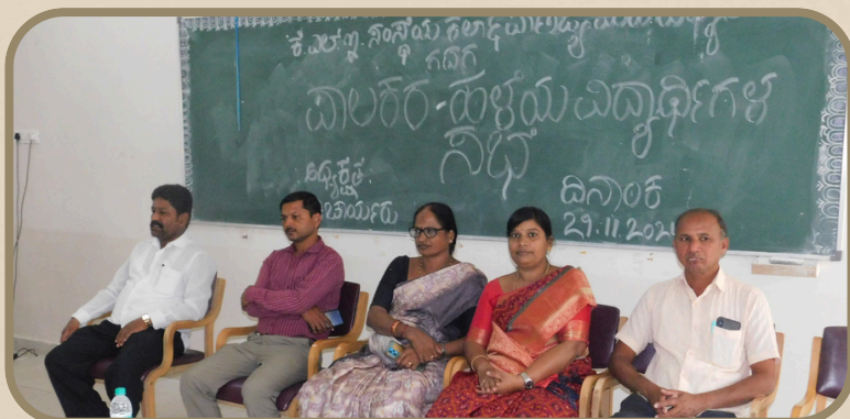
Parents and Alumni Meet