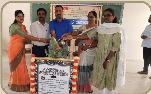
One Day Workshop on “Constitution Values and Morality” held on 26-11-2024