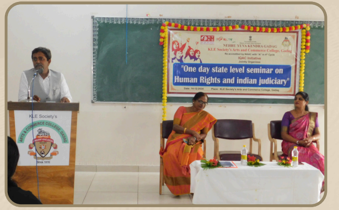
One Day State Level Seminar on "Human Rights and Indian Judiciary" on 14-12-2024