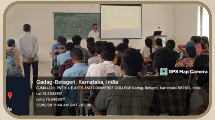
One Day Workshop on “Career Guidance in EV Sector” on 25-09-2024