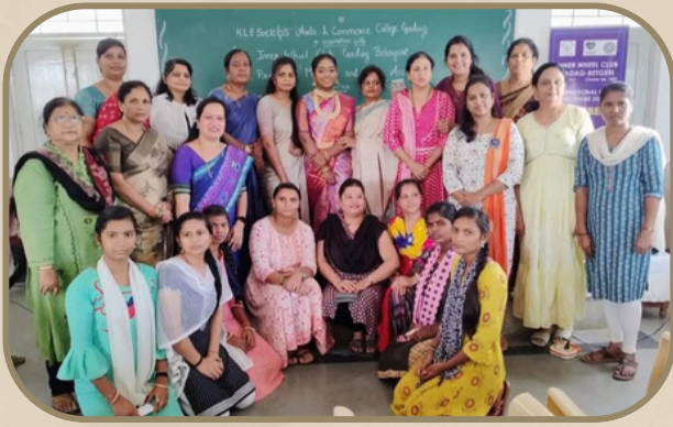
Tw Days Workshop on “Bridal Make-up and Hair Style” on 12 th and 13 th Sept 2024