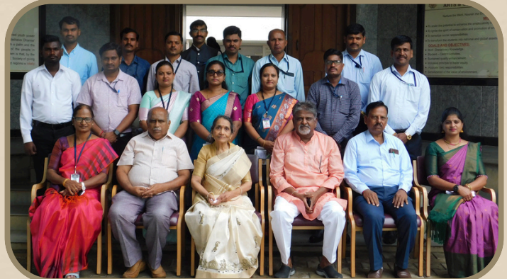
Valedictory Ceremony Group Photo