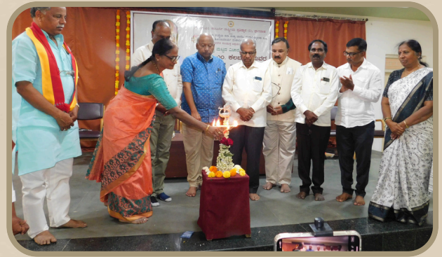
One Day State Level Seminar on “ Shri. M. M. Kalburgiavara Srujana Sahitya” 12-04-2024