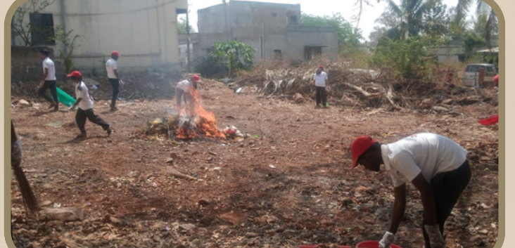
NSS Special Camp held at Adopted Village Nagavi, Cleaning Progrmme