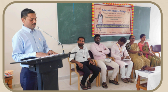
ICPR Sponsored Special Lecture on " Social and Political Philosophy of Ramaswamy Periyar" on 11-03-2025