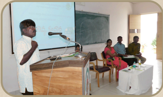
One Day Workshop on “Kavi Kavya Samvada” on 18-10-2024