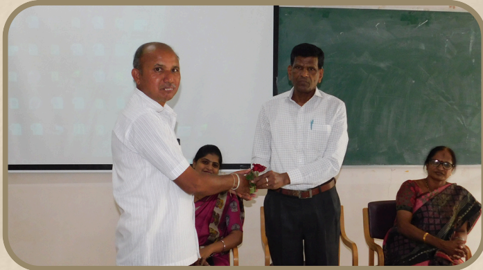
One Day Workshop on “State Budget Analysis” 02-04-2025