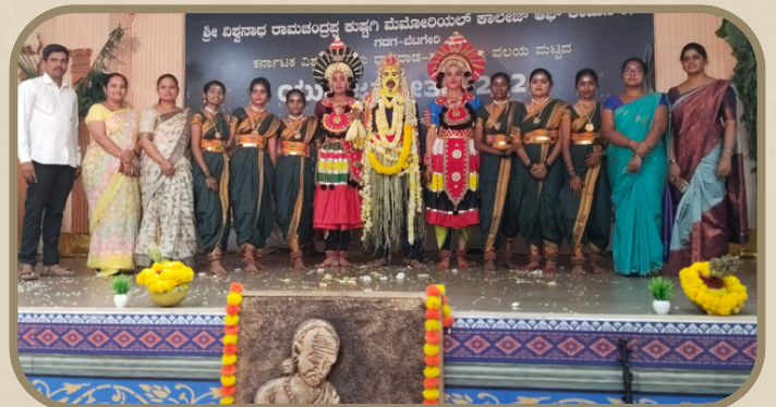
Glimpses of Youth Festival