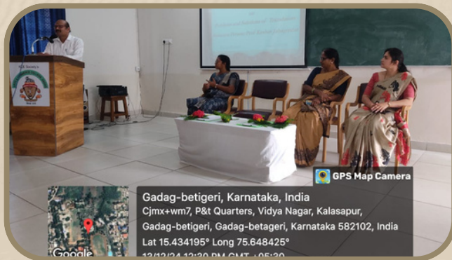
Special Lecture Programme on “Problems and Solutions of Translation” on 13-12-2024