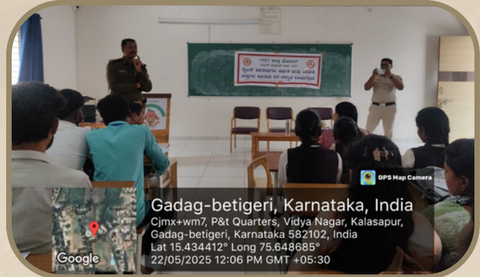
Workshop on “Cyber Crime and Evil effect of Drugs” on 22-05-2025