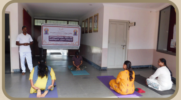
International Yoga Day held on 21-06-2025