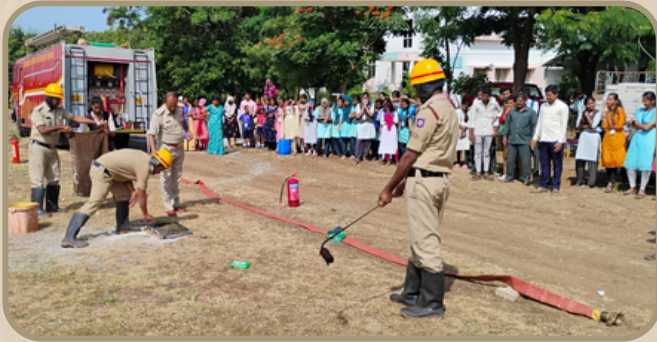
One Day Workshop on “Disaster Management” on 21-10-2024