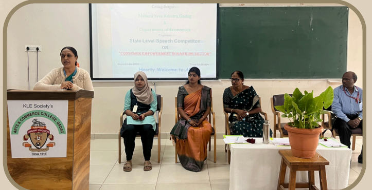
State Level Speech Competition on “Consumer Empowerment in Banking Sector” on 13-06-2025