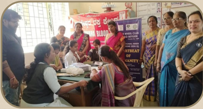
Free Hemoglobin Check-up Camp under Women Empowerment Cell in association with IWC, Gadag Betgeri