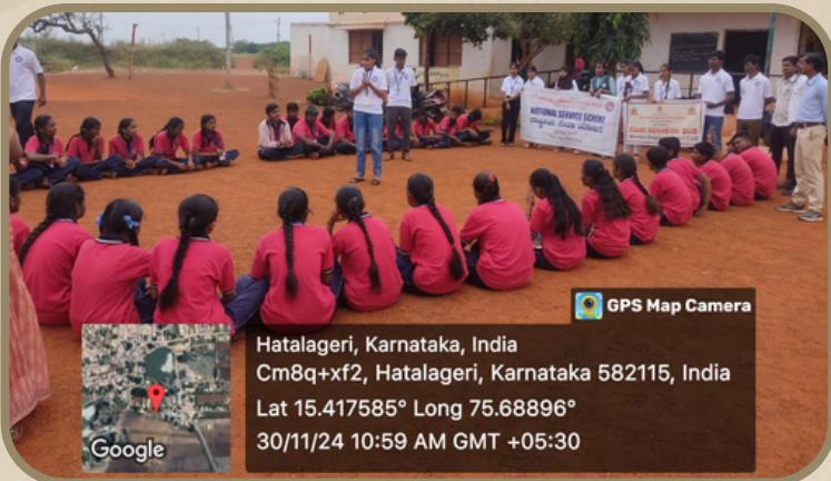
Awareness Programme on "Effects of Child Marriage" at GHPS, Halalageri by Women Empoerment cell on 30-11-2024